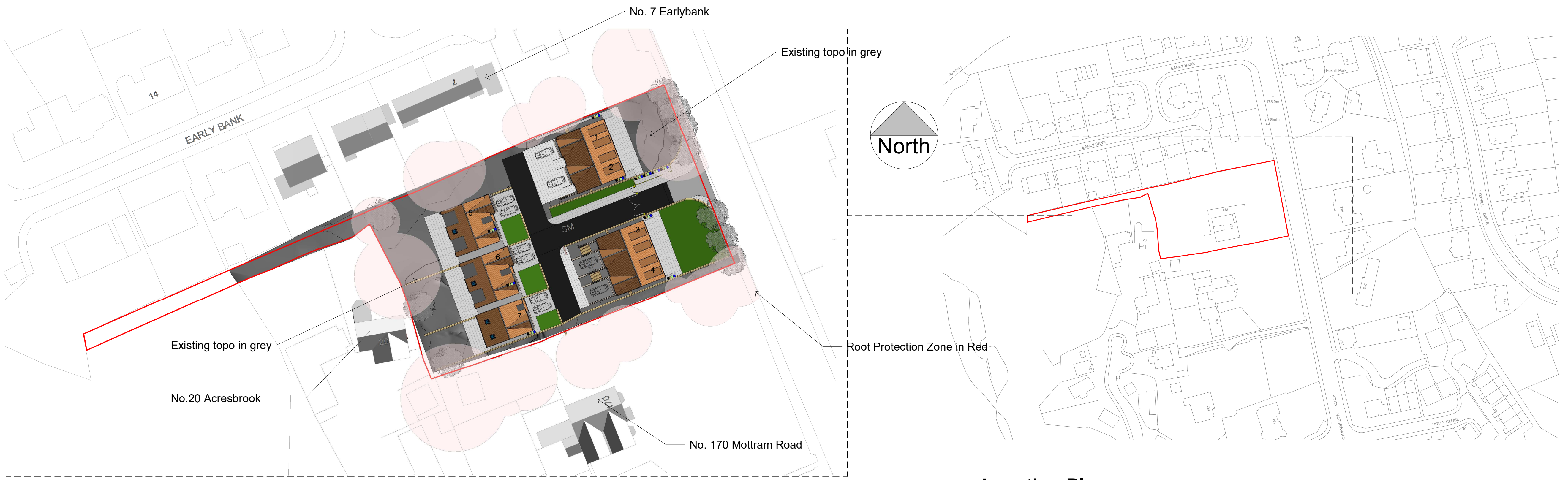
1 Location Plan 1 : 1250